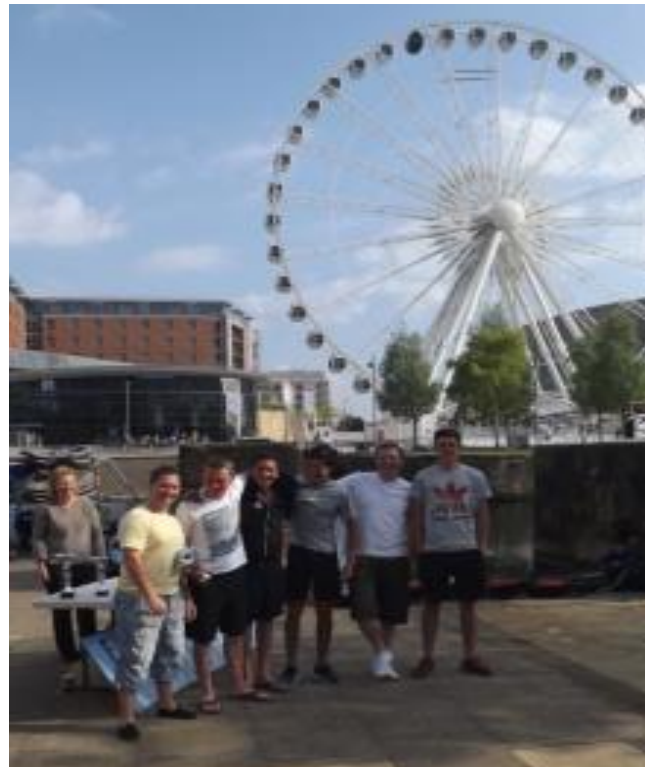
Runners up Team 225